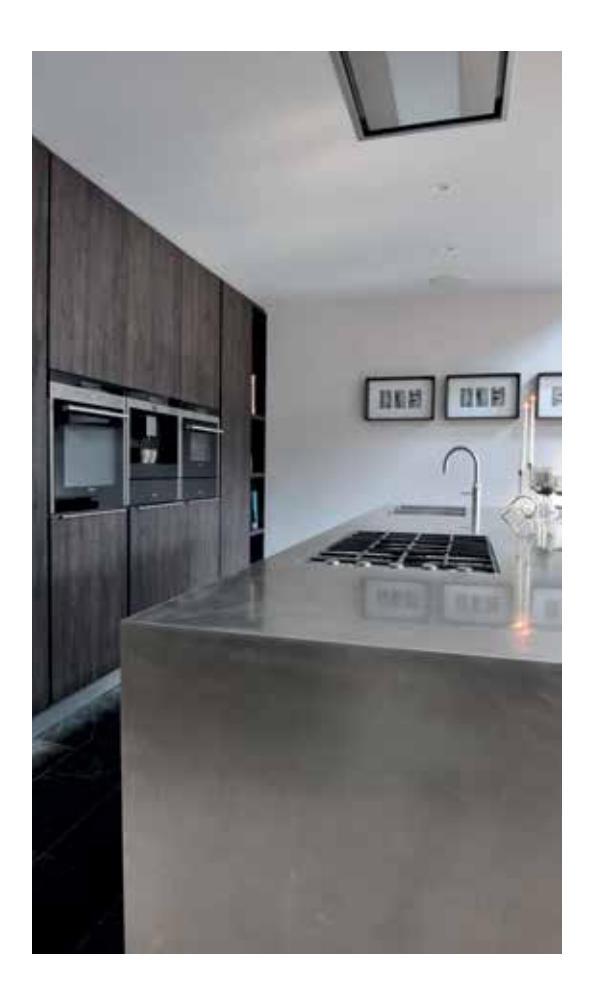
Above: A custom-made 4mm-thick steel island worktop with inset hob, twin sinks, Quooker tap and waste disposal add the air of professional kitchen.

to having a huge moment of doubt when it was installed. "That lasted all of five minutes, though, when I realised it was absolutely perfect and gave the kitchen the added wow factor that sets it apart from an off-the-shelf design."